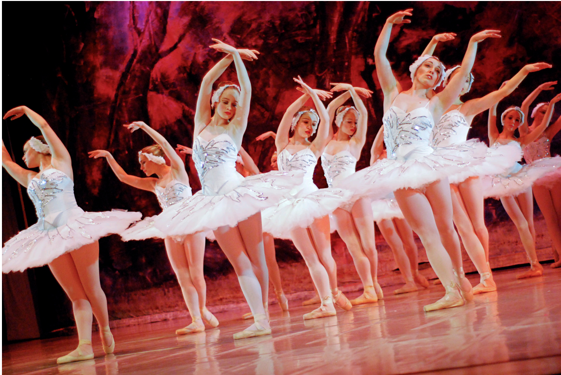
Northern Plains Dance is a non-profit performing arts organization in Bismarck, N.D. which MDU Resources Foundation has provided grants to for several years.